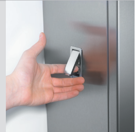
Flush manual release