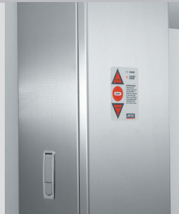
Flush membrane switch allows controls to be mounted remotely