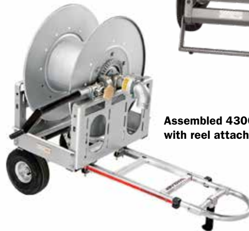
Assembled 4300-AL truck with reel attached